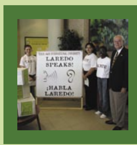
TAMIU students assisted in the survey effort.